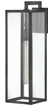
MAX LARGE WALL MOUNT LANTERN

25959K Simple, clean-cut, yet captivating, Max is an instant classic, perfect for a myriad of outdoor spaces. Max's simple construction and hand-welded aluminum frame embodies the modern inspiration behind the design. Surrounded by clear glass panels, it adds architectural simplicity to the touch of contemporary use alone.