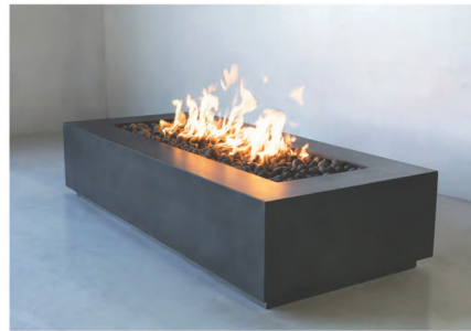
B - Fire Pit