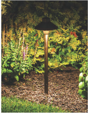
● Path Light