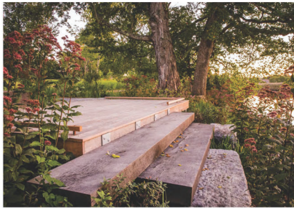
Fish Pier and Planting Character