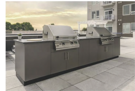
Outdoor Grilling Station