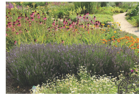
Perennial Planting Vocabulary

WALNUT PARK Residences 49 Walnut Street, Wellesley, Massachusetts 02481