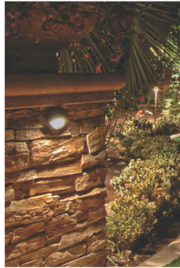
■ Wall Light