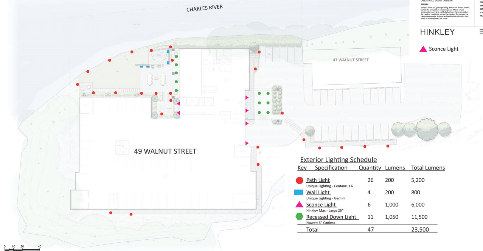
▲ Sconce Light