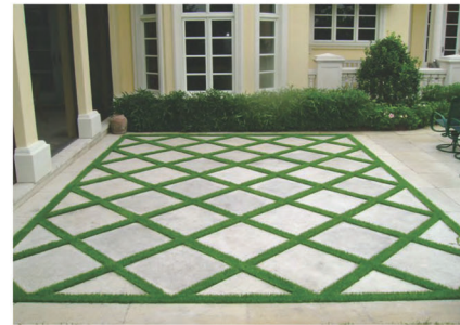
Paving Pattern at Dining Terrace and Courtyard