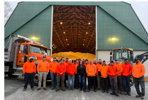
DPW crews work around the clock to keep Wellesley moving during winter storms

Residents using private contractors must ensure snow isn't pushed into streets, sidewalks, or onto fire hydrants to avoid creating safety hazards. To learn more, visit our winter operations page .