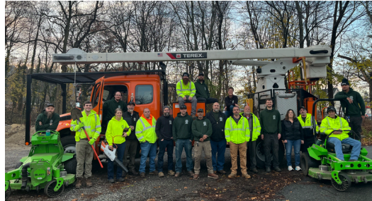
Meet the crew illuminating Wellesley this holiday season