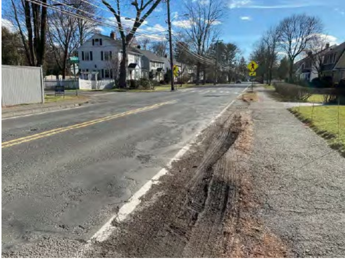
Poor road and sidewalk condition