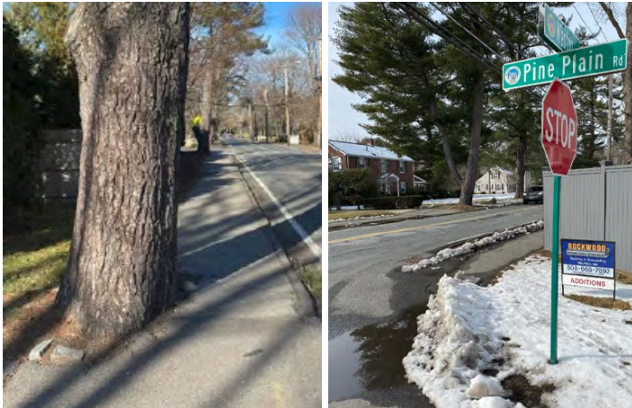
Obstructions and limited sightlines