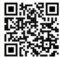
RDF Online Permits

Did you know that you can now apply online for your RDF Residential Permit? Visit the RDF Home Page or wellesleyma.viewpointcloud.com and click on the link to apply today.