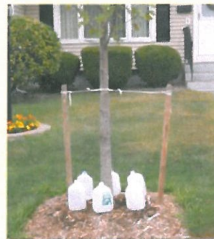
Watering technique using one-gallon jugs

You can also purchase watering bags that you fill, using a hose to allow for a slow soaking.