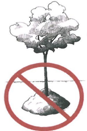
Improper mulch technique—piled on trunk and does not cover whole root zone