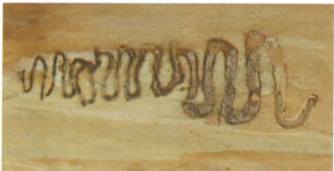
Figure 4. Gallery of an emerald ash borer larva.