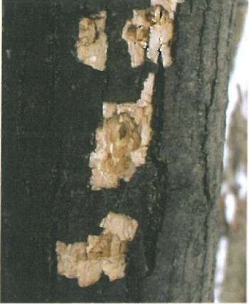
Figure 6. Jagged holes left by woodpeckers feeding on larvae.