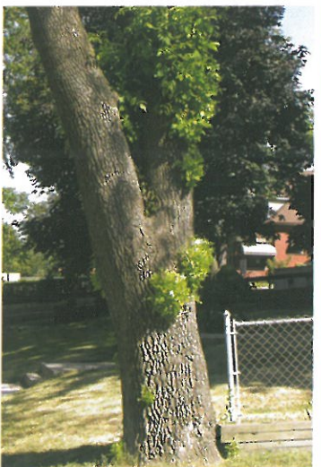
Figure 8. Epicormic branching on a heavily infested ash tree.

late April or May. Newly eclosed adults often remain in the pupal chamber or bark for 1 to 2 weeks before emerging head-first through a D-shaped exit hole that is 3 to 4 mm in diameter (Fig. 5).