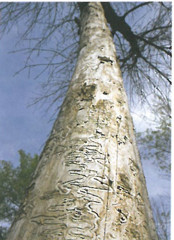
Figure 7. Ash tree killed by emerald ash borer. Note the serpentine galleries.