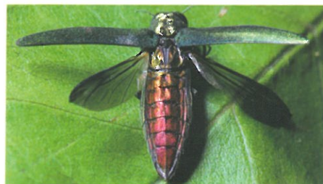
Figure 2. Purplish red abdomen on adult beetle.