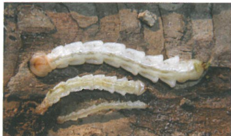
Figure 3. Second, third, and fourth stage larvae.