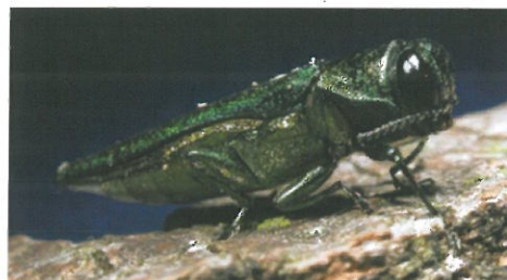
Figure 1. Adult emerald ash borer.

Prepupal larvae overwinter in shallow chambers, roughly 1 cm deep, excavated in the outer sapwood or in the bark on thick-barked trees. Pupation begins in